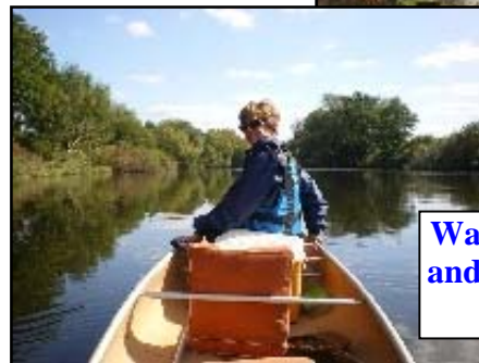
Walking in the hills and canoeing on the river Wye