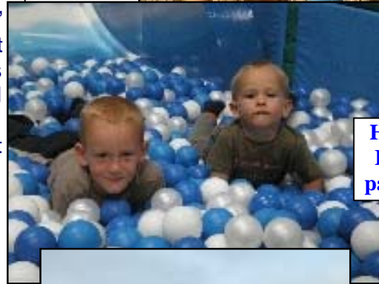
Hay bales and Ball park, all part of the fun!